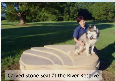
Carved Stone Seat at the River Reserve

The Kenilworth Information Centre not only caters for tourists but also provides information for locals and their helpful volunteers are always happy to help. Open 10am - 3pm every day except Christmas.